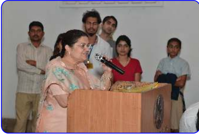
Chief Guest Speech – Ms. Rajashree Birla