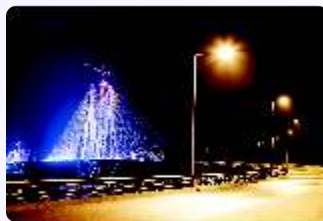
Bandra Worli Sea Link, Mumbai