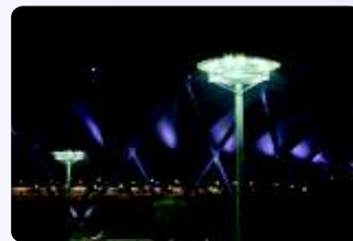
Jawaharlal Nehru Stadium, Delhi