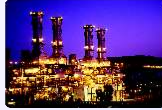
Power Station Lighting

Bajaj Electricals has executed several mammoth projects across the length and breadth of India. From elevated lighting that has brightened stadiums and outdoor spaces, to power transmission and other engineering projects; Bajaj Electricals Ltd. is forever committed to making a difference. Be it street lighting, rural electrification, infrastructure or utilities, Bajaj Electricals is paving the path for progress across every facet of life.