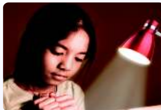
Rural Electrification - Power Distribution