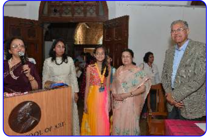
Painting Contest Winners