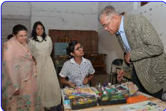
Chief Guest Interact with Participants