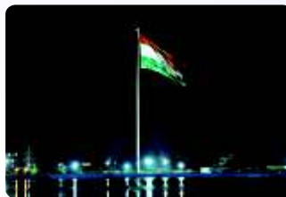
Flag Mast, Raipur