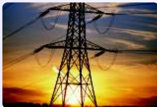
TLT - EHV (Transmission Line upto 765kV)