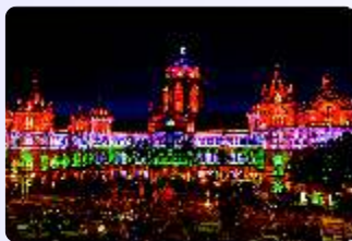
Chhatrapati Shivaji Terminus, Mumbai